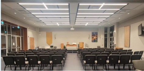
Como Lake United Church Sanctuary