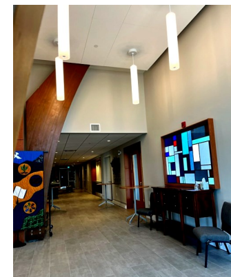
Como Lake United Church Atrium

The Atrium corridor leads us to our other functional, but well designed areas including: our kitchen, lounge, office spaces, meeting room and welcoming reception area, all of which work to make the light of our ministry shine bright!