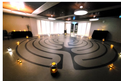
Como Lake United Church Labyrinth Hall

Join us on Tuesday mornings at 9:30 am for our Prayer Circle and Labyrinth Walk program, or call the office for times when the Labyrinth is open for self-guided quiet time.